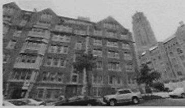
40-Story Tower at UTS On 122 nd Street