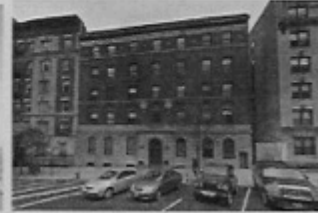
15-Story Tower at 411 West 120 th Street

Three luxury apartment towers are already planned