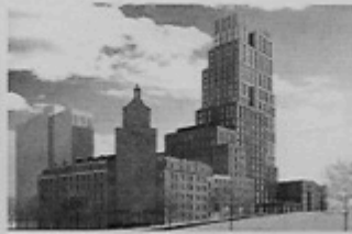
32-Story Savanna Tower at JTS on 122 nd Street